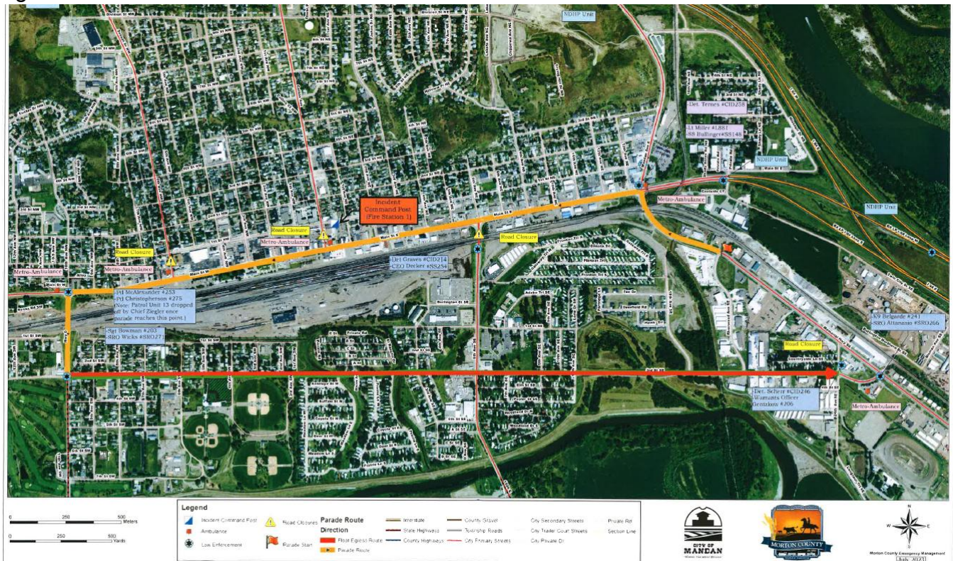
Figure 2: 2025 Mandan Parade Route